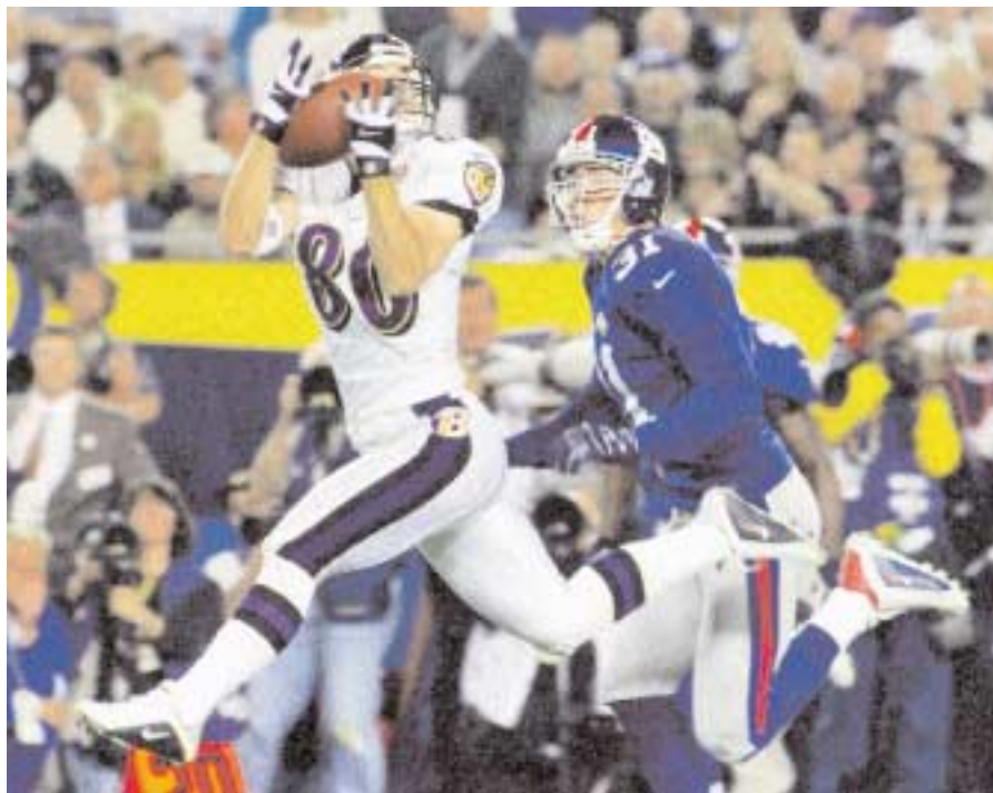
Baltimore Ravens receiver Brandon Stokley snags the first touchdown pass in a 34-7 victory against the New York Giants in Super Bowl XXXV. This photo of the former Ragin' Cajun® was splashed across sports pages of newspapers around the nation.

“It’s slowly sinking in,” he said. “It’s kind of overwhelming, still.”