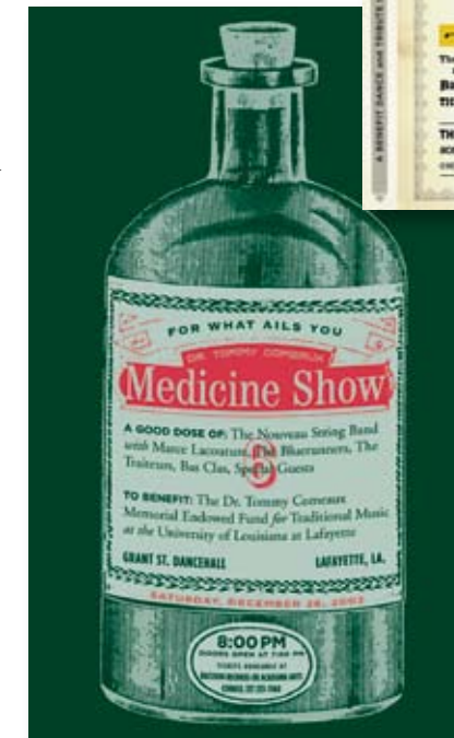
Sales of commemorative Medicine Show posters and live CDs have contributed greatly to fundraising efforts.