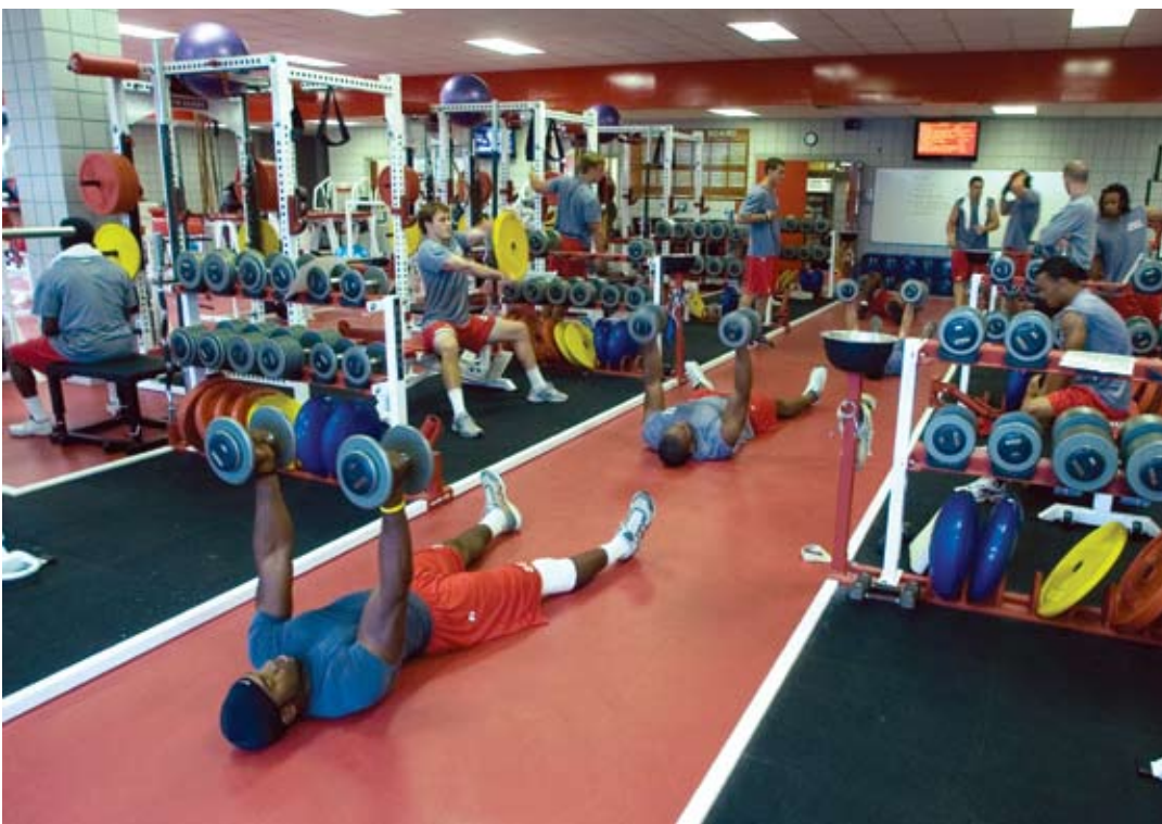
Thanks to customized equipment, the weight room can accommodate more student-athletes simultaneously.