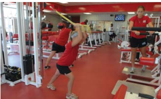
Members of the softball team work out.

area in the Athletic Center on Reinhardt Drive.