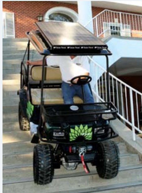
A Bad Boy Buggies representative demonstrated the solar utility vehicle's power by using its reverse gear to climb the outdoor stairs of Martin Hall.