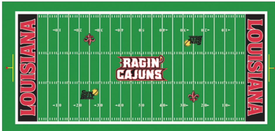
Cajun Field’s playing surface will require minimal maintenance to stay in top condition.

Early artificial turf was blamed for some serious injuries suffered by football players. “The bad knee injuries, and sometimes the bad lower leg injuries, came from when your foot got locked down in the artificial turf and your body was still trying to move. Your cleats would dig in and that’s when you would really hurt your knee or leg. I don’t think there’s ever been a documented case where a person’s foot got locked into this surface. That’s because part of the artificial turf is sand and