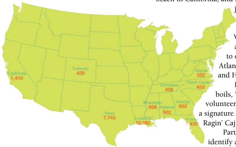
UL Lafayette grads gravitate to the southeast. Shown here are the numbers of alumni in Louisiana, plus the top 10 states outside of Louisiana.