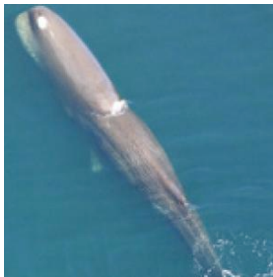
Sperm whale ( Physeter macrocephalus ).